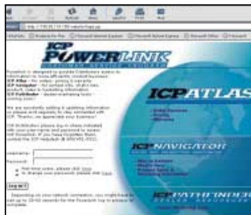
Powerlink Log-in Page