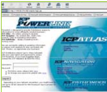
Powerlink Login Page